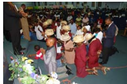
ABOVE AND LEFT: Photos from the Bahamas Crusade. BELOW: Leaders convene for Vision Globale.

gether leaders from Canada, the Dominican Republic, France, Guadeloupe, Jamaica, Martinique, St. Martin, Surinam, Turks and Caicos Islands, the United States, and of course, Haiti. Conference planners anticipate meeting every three years.