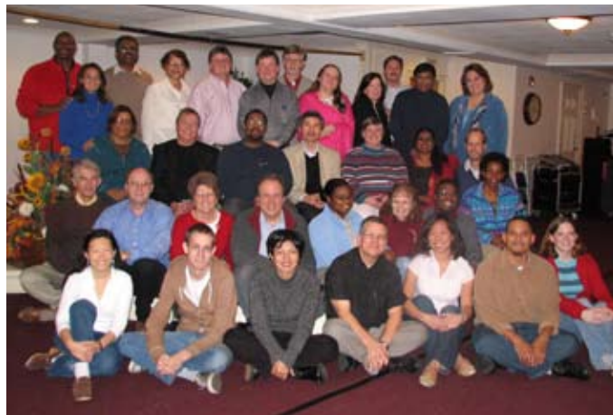
EGC Staff, November 2007