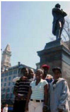
In April, students from HERC Junior Passport did a Scavenger Hunt at Faneuil Hall and went on a campus tour at Northeastern University.

EGC partners with churches and organizations in Boston, Worcester, and Lawrence to provide academic enrichment and support services to urban youth through four Higher Education Resource Centers (HERCs). Two additional affiliate sites began last year in