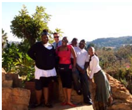
In July 2007, the youth group at Quincy Street Missional Church's youth group went on a mission trip to South Africa